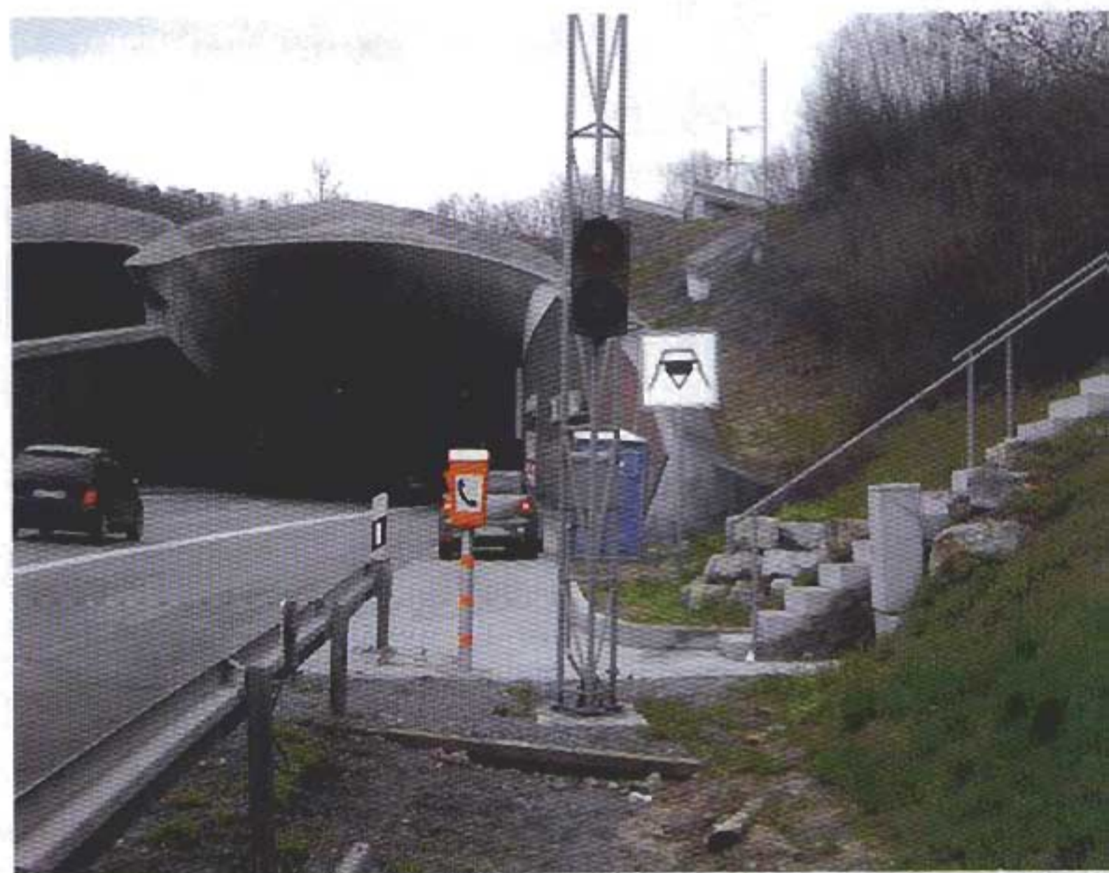
Entrance section of the newly renovated Kappelberg Tunnel, Germany.