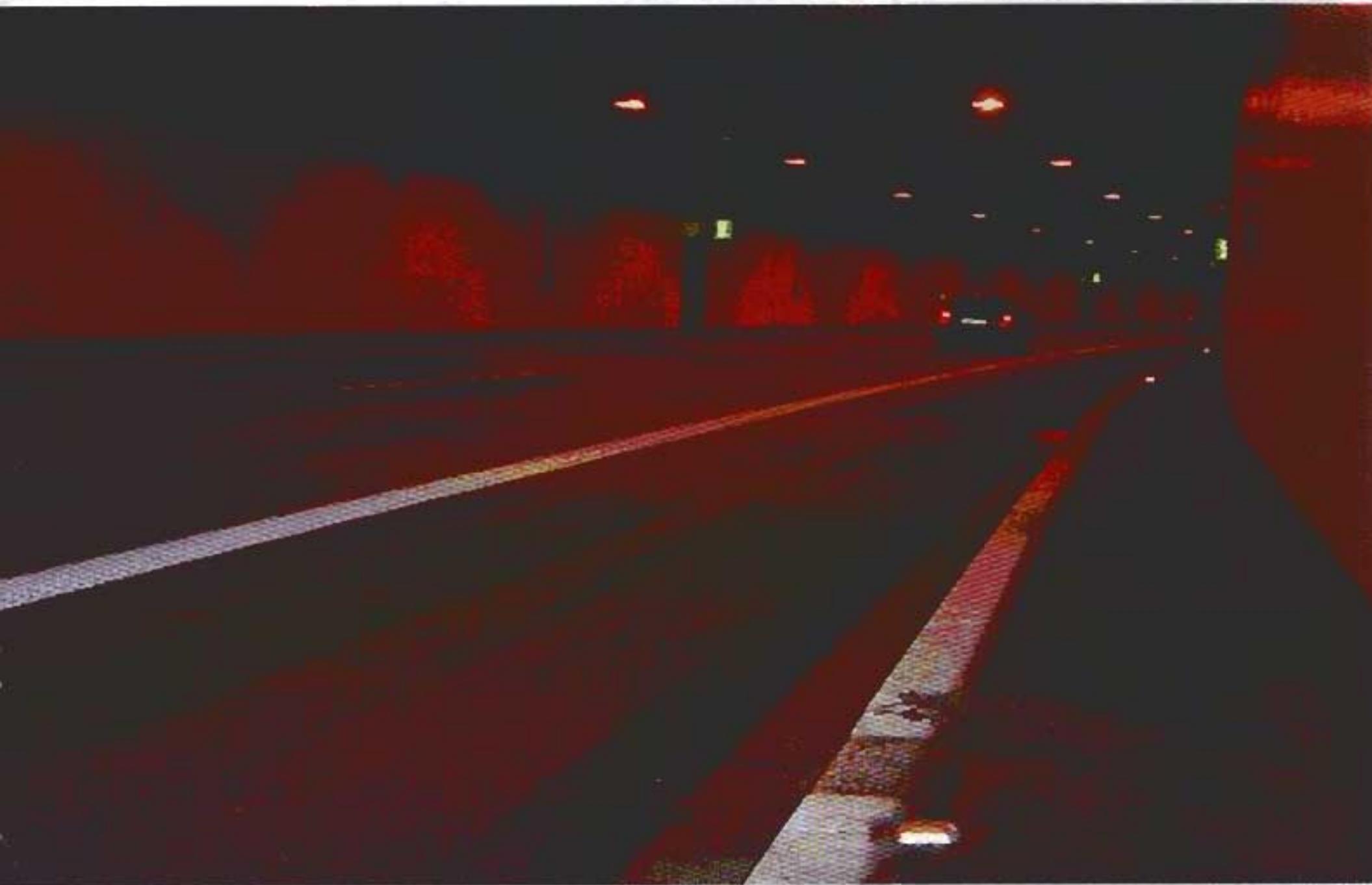
Inner section of the newly renovated Kappelberg Tunnel, Germany

The asphalt is very bright thus improving the light intensity inside the tunnel. The "lacquered" walls also contribute to this positive effect. Due to the installation of Swaroline LED modules the number of lights in daily use could be reduced considerably.